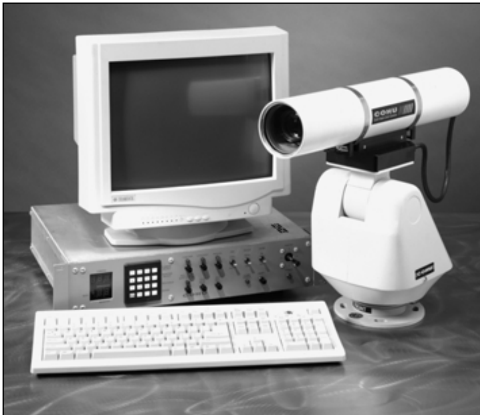
An MPC with CAMS computerized control offers outstanding versatility and flexibility to systems with up to 223 sites.

For additional information on expansion capabilities, options, and accessories, consult the Cohu Applications Engineering Group in San Diego or your local Cohu representative.